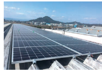
Solar panels on T-Gaia's logistics warehouse rooftops

In FY 2018, T-Gaia's subsidiary company (80% investment), Model-T Inc., started a renewable energy electric power business, utilizing spaces on rooftops of mainly mobile phone shops nationwide.