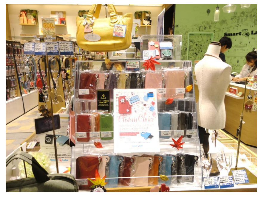
(Smart-phone cases with the popular "Ashiya Marty" brand name)