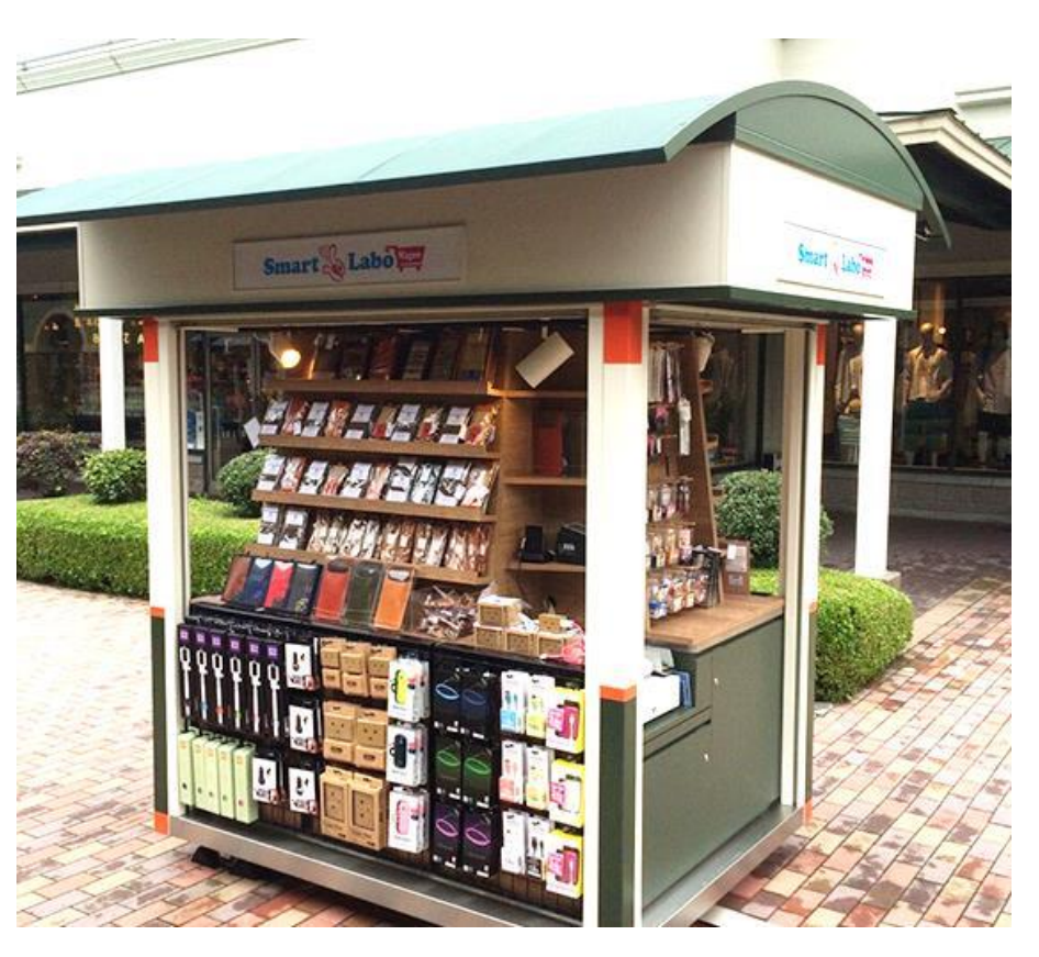
"Smart Labo Wagon" launched as new type of Smart Labo accessory shop in large shopping malls