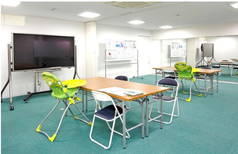
Multipurpose space for local events, etc.