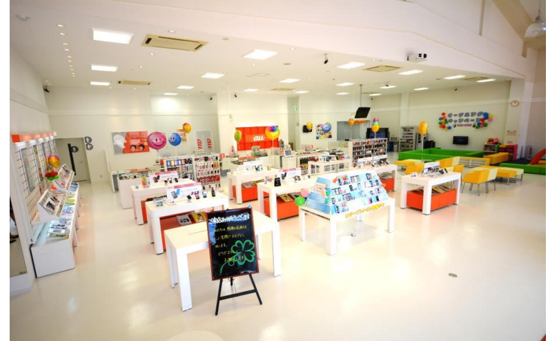
Broad space with barrier-free environment