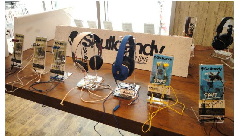
(Earphones & Headphones)