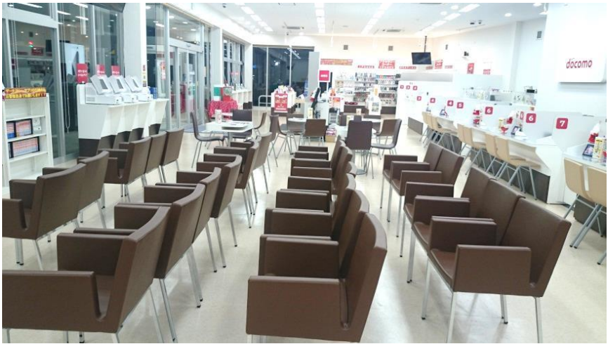
Spacious waiting space