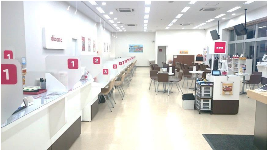
Reducing waiting time by setting up eleven counters