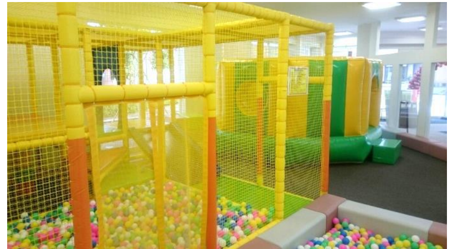
Large-scale kids' space