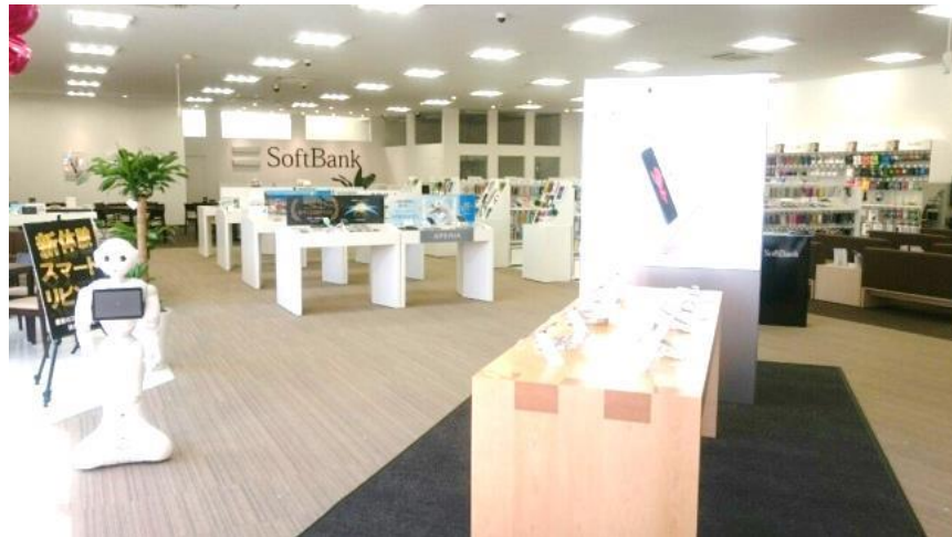
Flagship shop having a floor space of 500 square meters (Softbank)