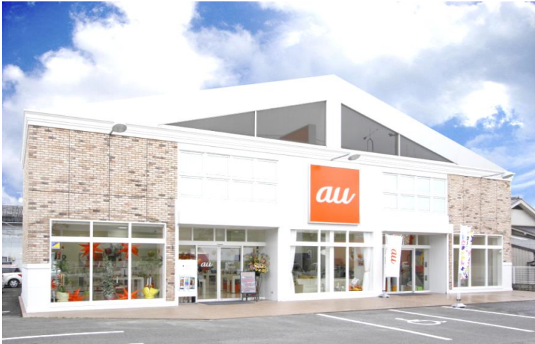
One of the largest au Shop in Shikoku area