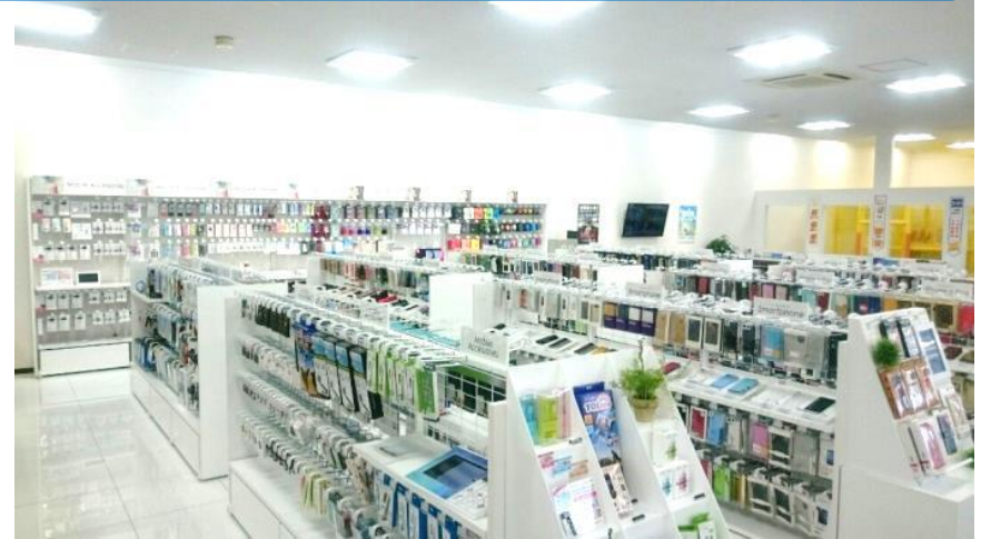
Accessory section with abundant product lineup (Softbank)