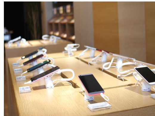
(Low-price SIM cards & SIM unlock smartphones)