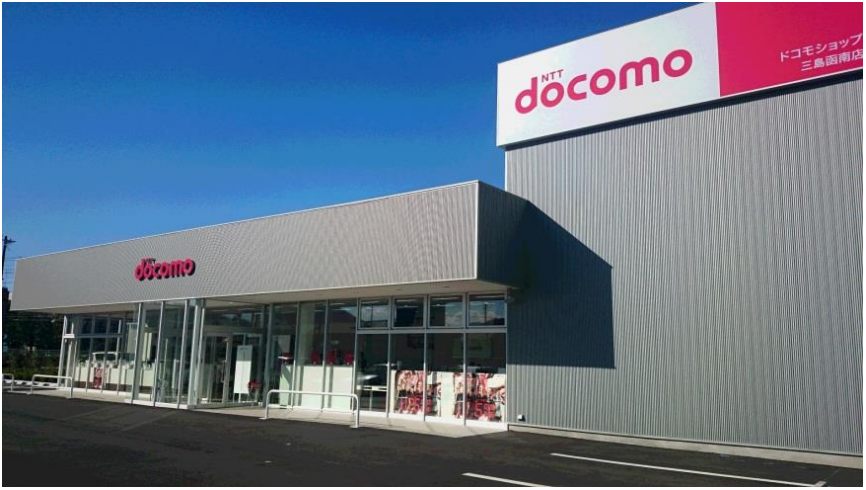
One of the largest Docomo Shop in Shizuoka Pref.