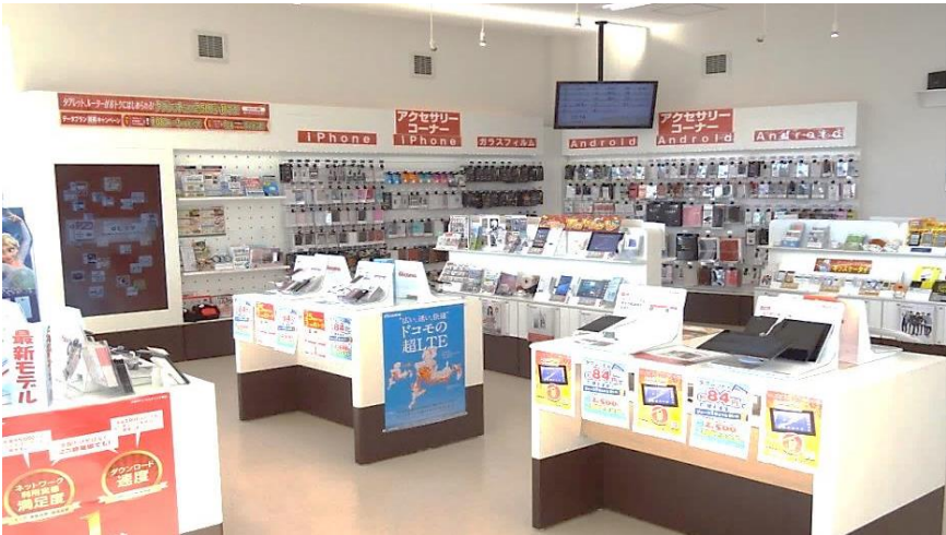
Accessory & tablet section with abundant product lineup