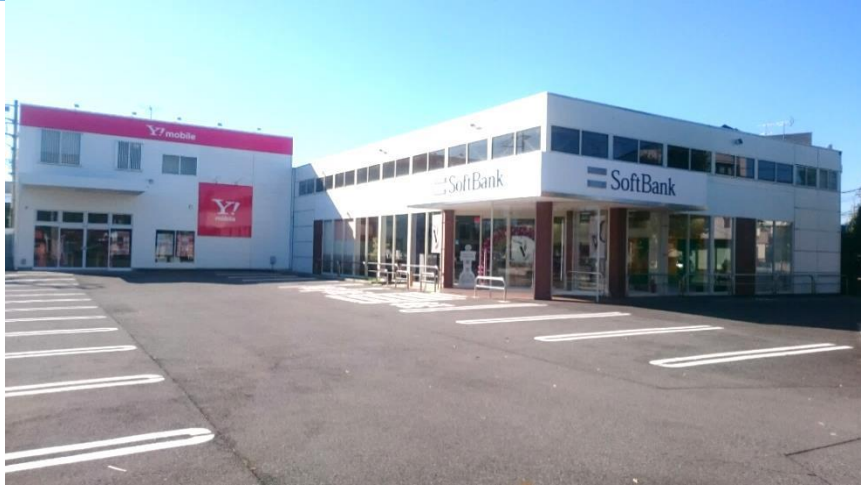
Parallel establishment of Softbank Shop & Y!mobile Shop