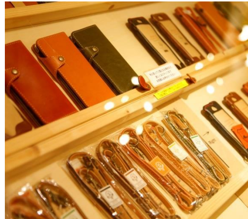
(High-grade leather cases)